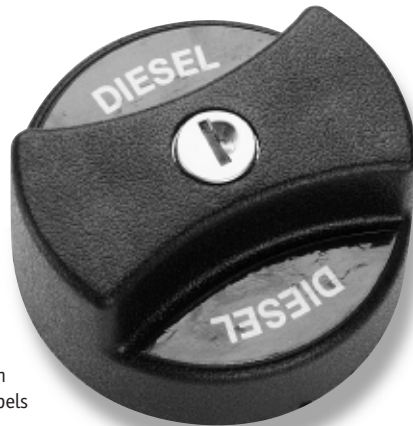
Locking cap with optional 'Diesel' labels