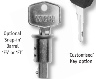
Optional 'Snap-in' Barrel 'FS' or 'FT'