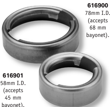
616900 78mm I.D. (accepts 68 mm bayonet).

These are internally-flanged neck ends in mild steel, suitable for brazing to plain pipes at 76 mm (3 inch) and 57 mm (2.25 inch) diameter. Height is 18-20 mm only.