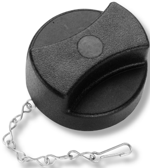
Non-locking cap with optional chain

This model has been used by every British truck manufacturer as well as for 'static' applications such as power generator sets. Recommended specification is fully sealed but the 'Waso' venting system will suit some applications. Caps fit "internally-flanged" neck-ends, (illustrated) which can be brazed onto a plain filler pipe, generally at 76 mm (3-inch) diameter.